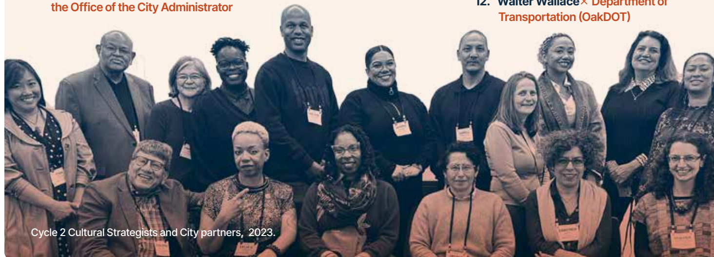
Cycle 2 Cultural Strategists and City partners, 2023.