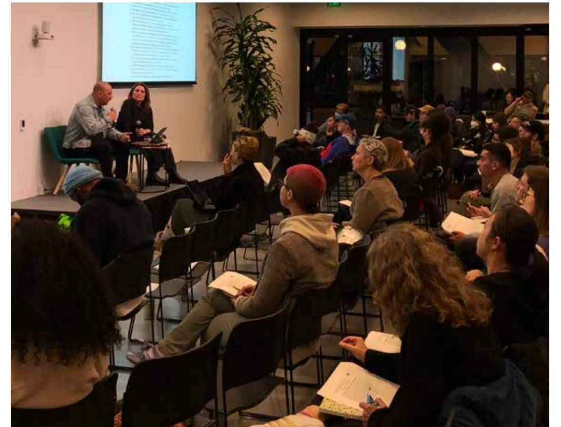
One of the Public Art Program workshops. Overall, 78 artists completed the series.