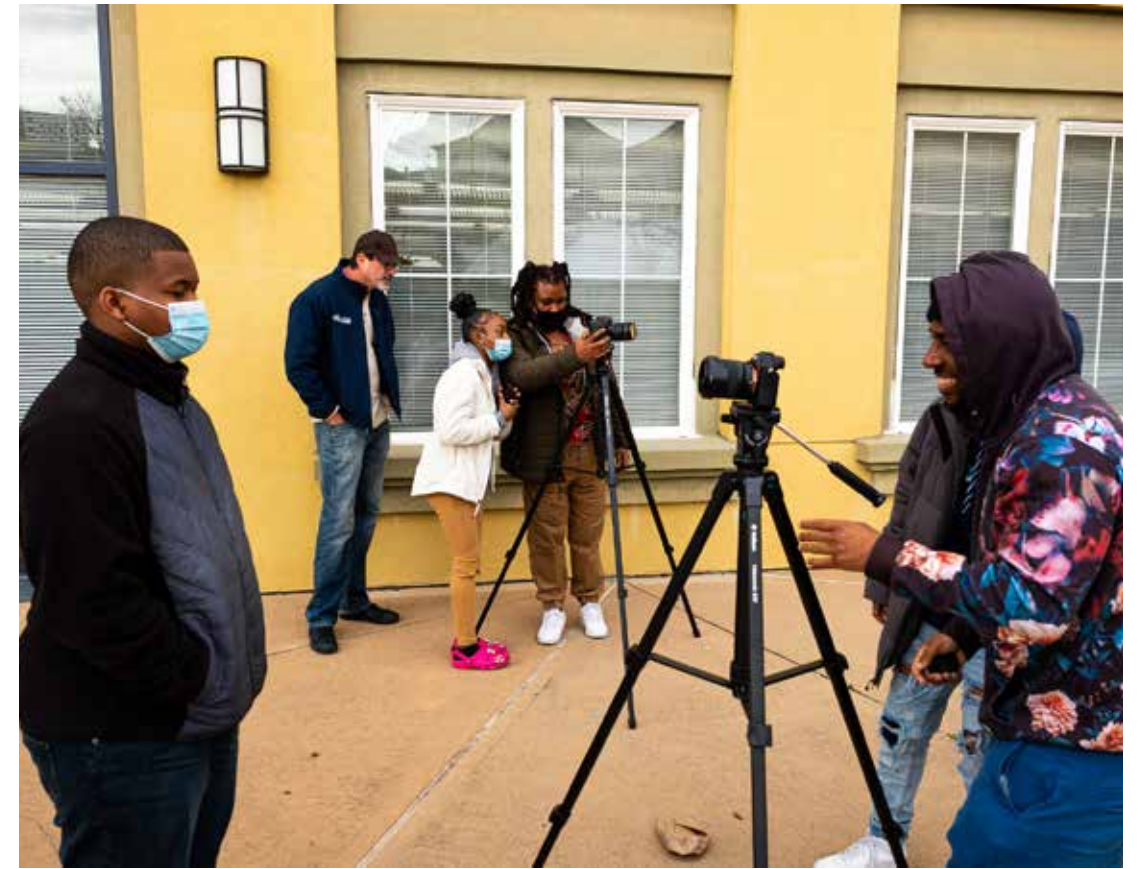
Participants in a photo and video workshop organized by CSIG Walter Wallace. The workshops served over 1,000 Oakland residents.

"I've found that a lot of people will give up on a certain thing because they don't trust it. But like you're saying, trust has to be built, and inevitably it gets broken and has to be rebuilt again. And I think the project I was part of kind of reflected an ideal process of trust-building, it was just at a small scale."