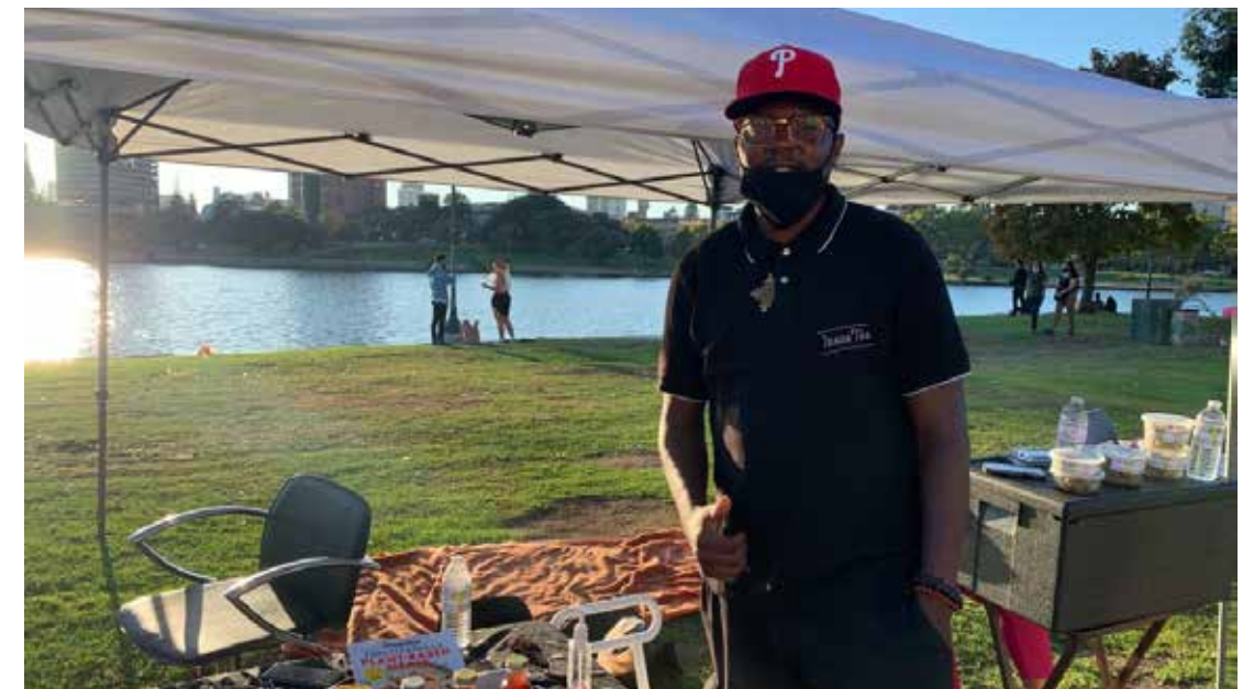
An Oakland vendor at Lake Merritt, 2023.