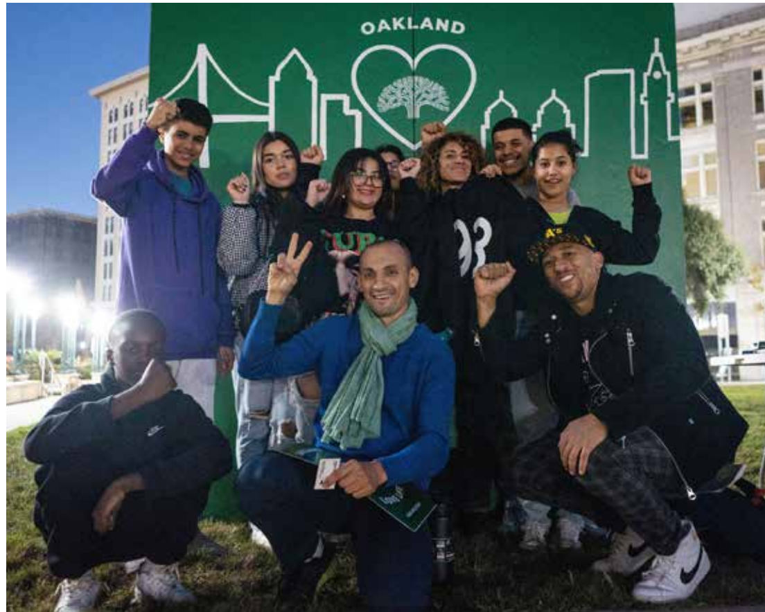
Oakland residents pose with CSIG Key Choice on Love Life Day, 2022.

In part, my project was successful because people know me; they know my work has integrity and that brought people to the table. Honestly, it was both a blessing and a challenge, in terms of how much work we had to do, to realize how much demand there was once people felt like it was a place they could trust and participate in. We ended up reaching hundreds of people in person. These projects otherwise just simply wouldn't reach these communities, BIPOC communities. Which means these projects might not even be possible without our role, or if they were, they would take years of staff effort and dedicated resources. And unfortunately, we know Oakland really doesn't have that kind of time or money right now.